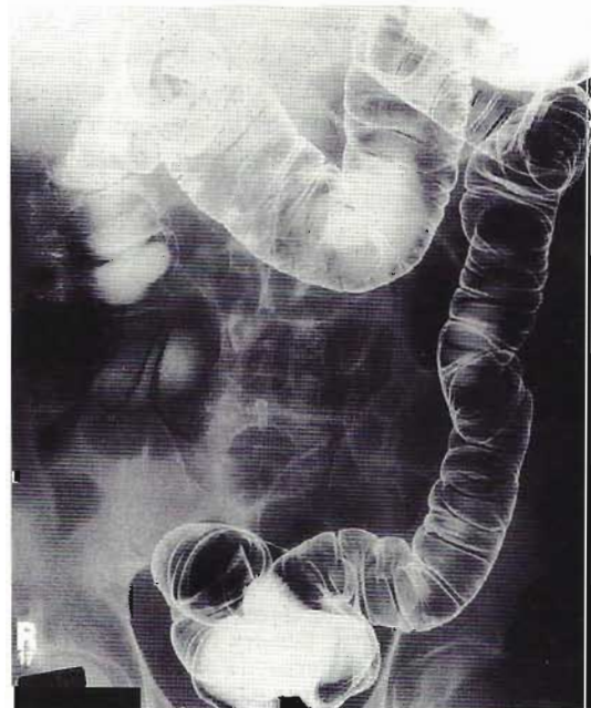
FIG. 2. Postoperative double-contrast barium enema demonstrating the ascending colon and cecum located in the right hemi-abdomen.

The diagnosis of malrotation beyond the neonatal period is difficult because of the wide variety of symptoms associated with this condition (3,4). Cases with or without emesis should be evaluated with an upper gastrointestinal and small bowel series as well as a barium enema. Asymptomatic patients in whom malrotation is diagnosed serendipitously should undergo surgery to correct the malrotation. Acute midgut volvulus with infarction can